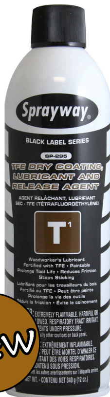
NET WT. 12 oz.

The entire industrial line of products are in compliance with the evolving regulatory bodies for V.O.C. compliancy. These formulas have been developed, tested and refined to deliver the best products to the market. While they outperform the competition - they may be obtained at a substantial cost savings.