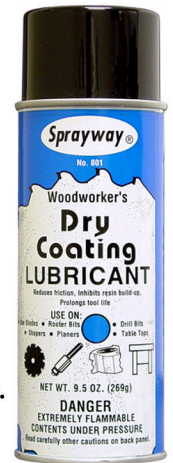
NET WT. 9.5 oz.

ONE PRODUCT THAT PERFORMS THE JOB OF TWO!